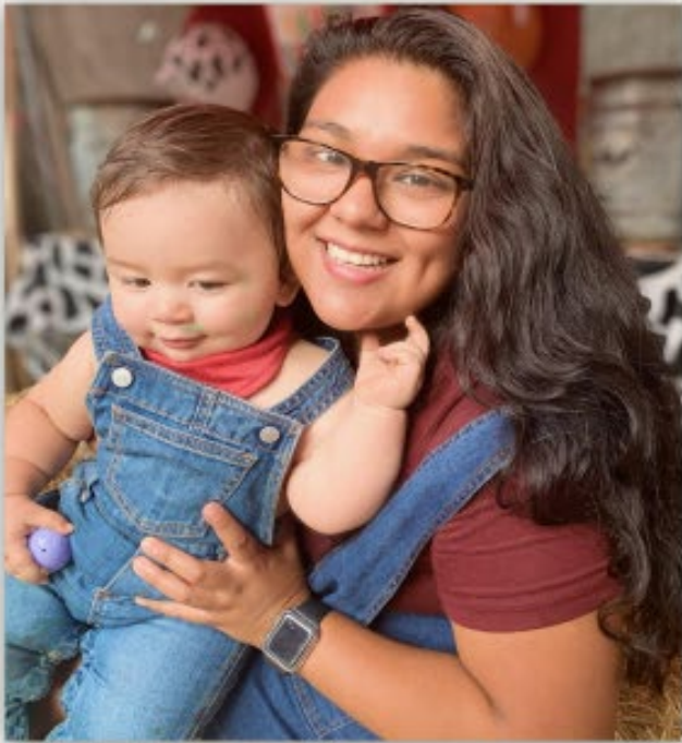
Stranger on Stranger Abduction August 28, 2020