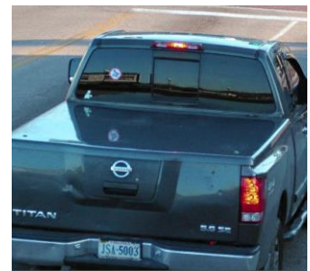
Photos of suspect's vehicle