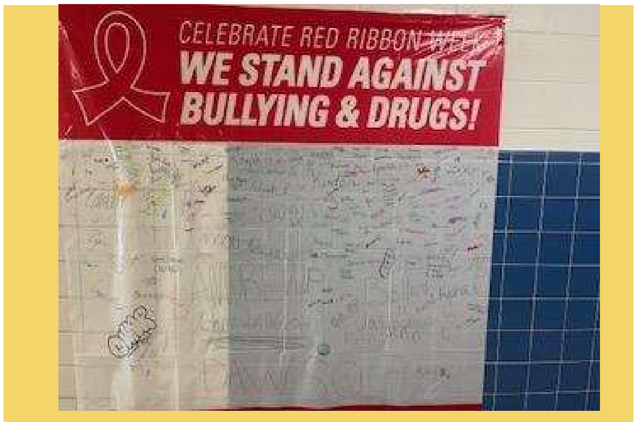
CHHS Red Ribbon Pledge Poster

Office on Youth partners with Colonial Heights High School to offer youth an opportunity to raise awareness for the prevention of the use of alcohol, drugs, and other substances by youth. Youth learn leadership skills needed to address common issues among youth. The club is led by adult advisors from CHHS and the Office on Youth. Club meetings take place after school as scheduled. Youth plan and lead events throughout the school year such as Red Ribbon Week, Project Sticker Shock and YADAPP. In FY24, youth chose “Choose to Refuse” as their theme. During Red Ribbon week, wristbands with the “ Choose to Refuse ” message were given out. Members asked classmates to join in standing against drug use by signing a pledge poster